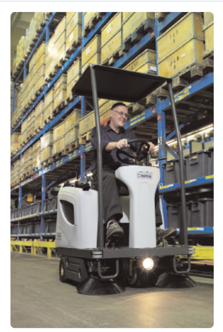
Large range of optional accessories provides the right tools for specific jobs e.g. carpet kit, special filters and brushes, overhead guard, 2x18 litres hopper containers etc.